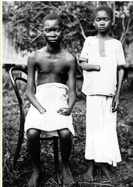
Colonial Violence in the Congo Chapter 18, Ways of the World: A Brief Global History , Second Edition and Ways of the World: A Brief Global History with Sources , Second Edition Copyright © 2013 by Bedford/St. Martin's Page 618 (page 894, With Sources)

1. Who are these two boys, and where do they live?