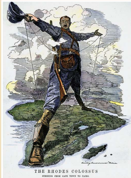
THE RHODES COLOSSUS STRIDING FROM CAPE TOWN TO CAIRO.

Visual Source 18.3 From the Cape to Cairo Chapter 18, Ways of the World: A Brief Global History with Sources , Second Edition Copyright © 2013 by Bedford/St. Martin's Page 926