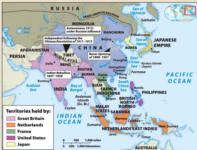
Map 18.1 Colonial Asia in the Early Twentieth Century Chapter 18, Ways of the World: A Brief Global History , Second Edition and Ways of the World: A Brief Global History with Sources , Second Edition Copyright © 2013 by Bedford/St. Martin's Page 610 (page 886, With Sources)