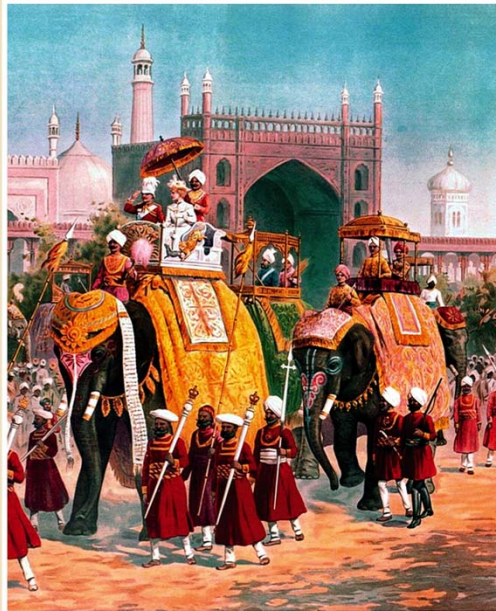
The Imperial Durbar of 1903 Chapter 18, Ways of the World: A Brief Global History, Second Edition and Ways of the World: A Brief Global History with Sources, Second Edition Copyright © 2013 by Bedford/St. Martin's Page 602 (page 878, With Sources)