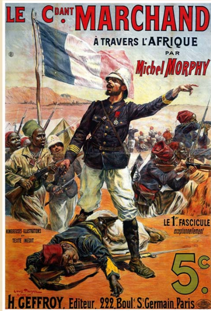
Visual Source 18.2 Conquest and Competition Chapter 18, Ways of the World: A Brief Global History with Sources , Second Edition Copyright © 2013 by Bedford/St. Martin's Page 925