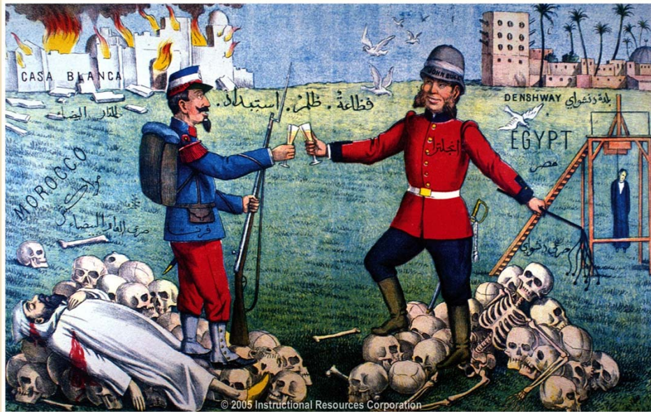
Visual Source 18.4 British and French in North Africa Chapter 18, Ways of the World: A Brief Global History with Sources , Second Edition Copyright © 2013 by Bedford/St. Martin's Page 927