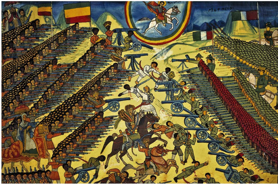
Visual Source 18.5 The Ethiopian Exception Chapter 18, Ways of the World: A Brief Global History with Sources , Second Edition Copyright © 2013 by Bedford/St. Martin's Page 928